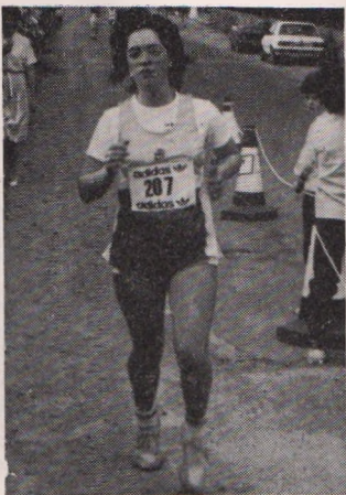
1st Carrigaline lady