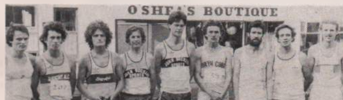
Top 9 men

1, Croom (90, 140, 157), 387; 2, North Cork (79, 167, 171), 427; 3, Lough Gur.