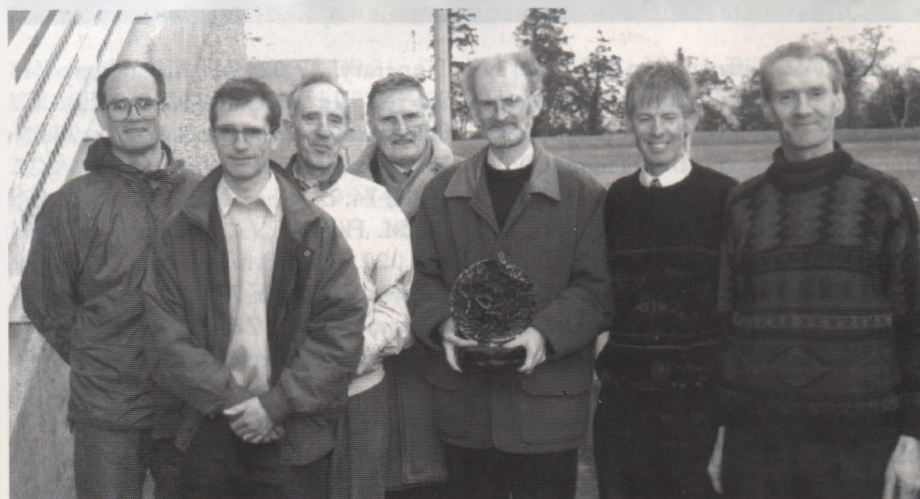
St. Finbarr's Vets team winners