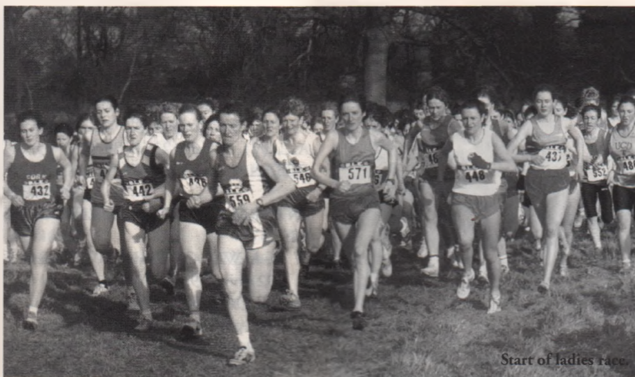
Start of ladies race