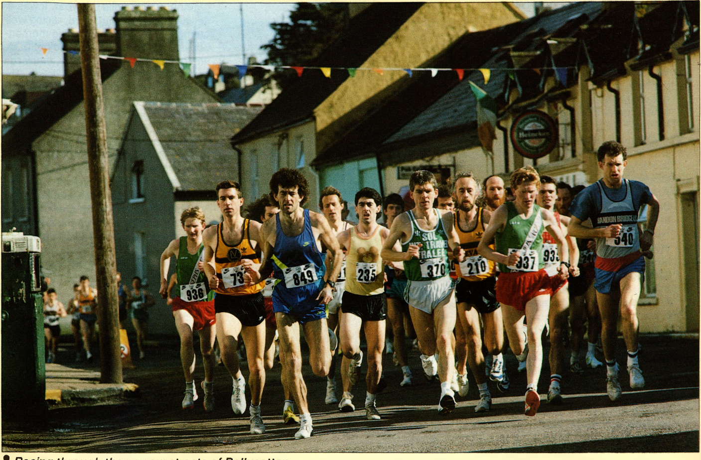
Racing through the narrow streets of Ballycotton

Weather conditions were near perfect for this year's Ballycotton promotion held on March 10th, and the big entry reflected the ever increasing popularity of this quite charming event.