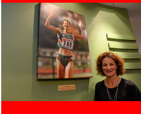
Sonia O'Sullivan, inducted into Athletics Ireland Hall of Fame

One of Cork's most famous sports persons, Sonia O'Sullivan was recently honoured with the Hall of Fame award at this year's Irish Life Health National Athletics Awards. Sonia received the award on the 28 th of November, the day of her 50 th birthday.