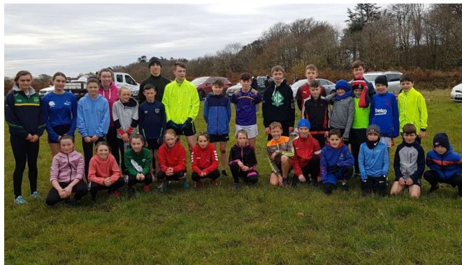
Some of the athletes that took part on the day

A great training session was completed by all the groups, and they all put in 100% effort on the day. A big thank you is also due to the personal coaches who helped out on the day.