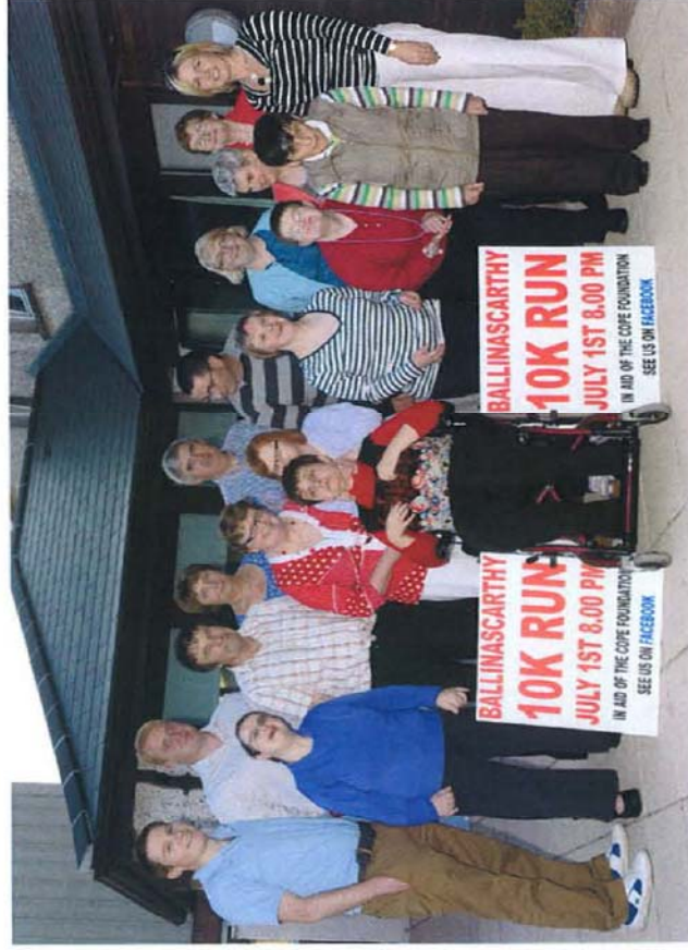
Photo at Launch of Ballinascarthy 10KM run in Cope Foundation Clonakilty

Fyffes Bananas Katie's Real Chocolates Kinetica Allfresh Wholesale Ltd Fruit & Vegetables Clona Dairy Products Irish Yogurt